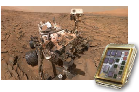
Sensors and Specialist Components

The Sensors and Specialist Components division works with customers to develop standard and customised solutions including sensors and power management devices. Our solutions improve the precision, speed and reliability of critical aspects of our customers' applications.